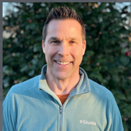
Dear Church Family,

As followers of Christ, we are called to a mission greater than ourselves. The Bible makes it clear that missions are not just a part of the Christian life—they are central to it. Jesus' final words to His disciples in Matthew 28:19-20, the Great Commission, command us to "go and make disciples of all nations." This is not a suggestion, but a mandate to take the Gospel to every corner of the world.